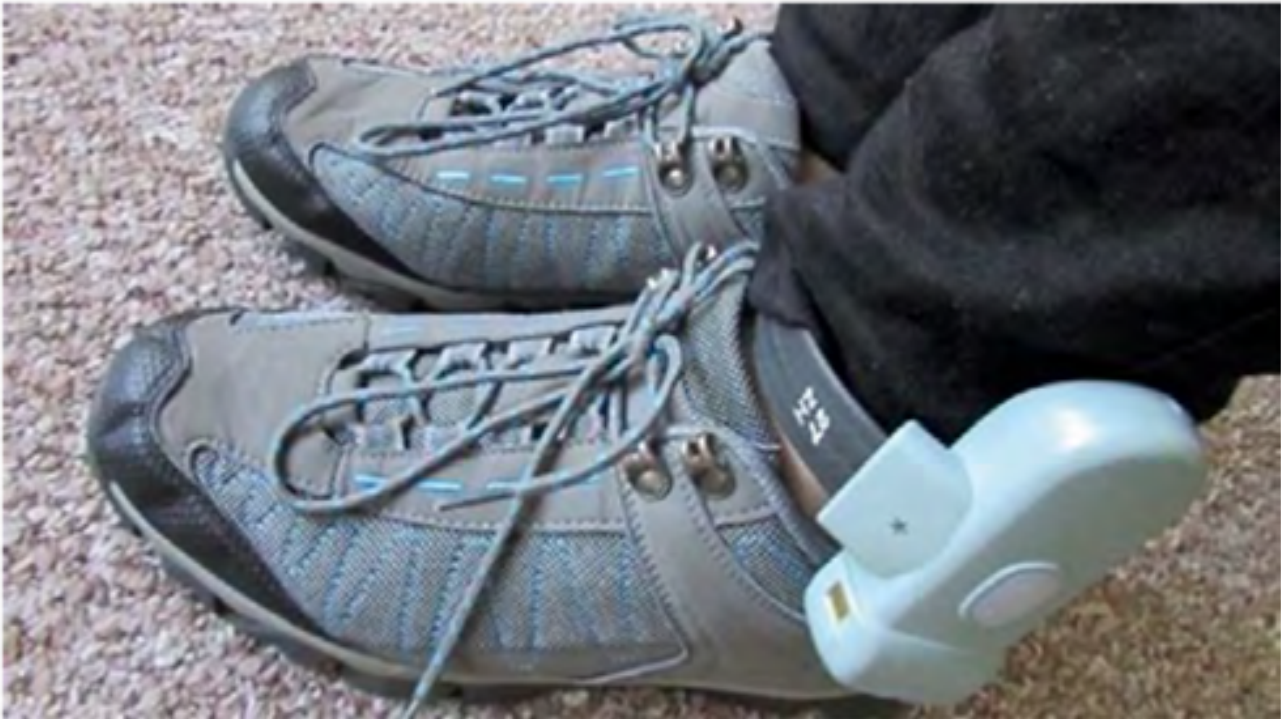
Figure 1: GPS electronic monitoring ankle tag.

The Ministry of Justice holds the contract for electronic monitoring services across government departments. Their main electronic monitoring contractor Capita runs Electronic Monitoring Services (EMS), with a further contractor (G4S) supplying the physical equipment they use [36]. Location data is communicated using Telefonica's mobile network to Airbus, who process and verify the data and present the information to Capita EMS [37]. The cost of GPS tagging has been estimated at £55 per wearer per day [38]. Concerns have been raised about poor battery life of GPS tags, devices failing to charge properly and individuals having to spend several hours a day waiting for it to charge [39].